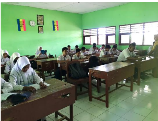
Picture 1.2. Teacher applies talqin method