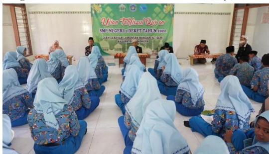
Picture 1.5. Grade 8 students take the tahfidz exam

The tahfidz program for students at SMPN 1 Deket is juz 30, starting from grade 7 to grade 9. To evaluate and appreciate students in tahfidz Al-Qur'an program, SMPN 1 Deket enforces tahfidz exam and tahfidz graduation. Though, not all students are easy to memorize since their background comes from various elementary schools or they have never participated in the TPQ. Therefore, students who pass the tahfidz graduation exam are those who meet the memorization targets that have been determined by the school.