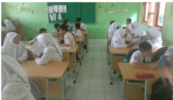
Picture 1.4. Impelementation of muroja'ah method

The muroja'ah method is carried out in pairs to listen to each other, and sometimes in groups guided by the teacher to repeat memorization several times. However, these three methods are difficult to apply to inclusive students. SMPN 1 Deket is an inclusive school, because it is a school that welcomes all students regardless of gender, ethnicity, social, economic, and educational needs. All students can learn, contribute, and perform in all aspects of life at school. Students in inclusive schools can spend time studying with their friends to get mutual benefits of the school system.