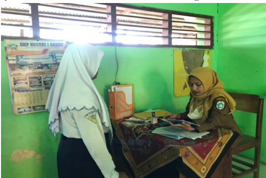
Picture 1.3. Teacher applies tasmî' method

Tasmî' method is a method that is carried out by delivering to the teacher, so students take in turn perform memorization in front of their teacher, and the teacher immediately listens carefully as well as corrects the reading if something goes wrong.