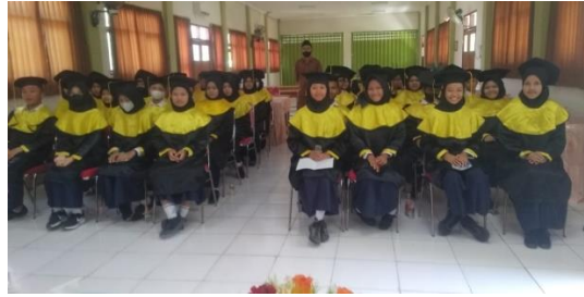
Figure 1.6. Tahfidz Graduation of Grade 8 Year 2022

The picture showed the tahfidz graduation of grade 8 on August 30, 2022 at SMPN 1 Deket Lamongan. The results of observations and data collection showed that in addition to spiritual intelligence, intellectual and emotional intelligence improved. The success of memorizing fluency, by muroja'ah method, repeating or reading memorization in front of friends or teachers, will leave a memorizing mark in the heart that is much better five times or more than reading or repeating alone. 32