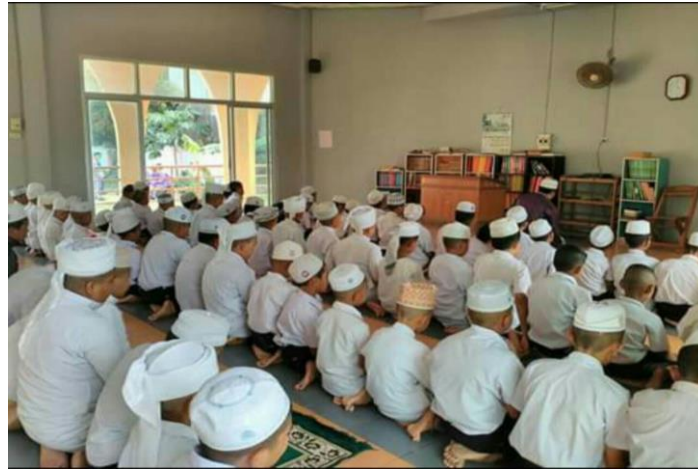
Figure 1. Prayers in Congregation