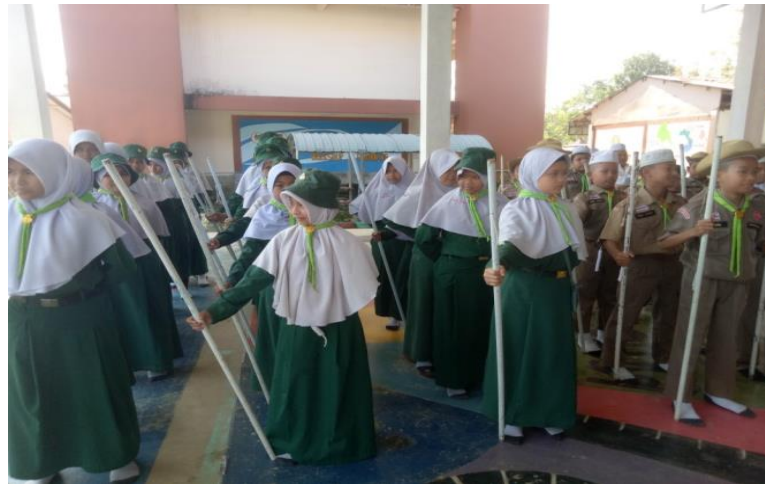
Figure 2. Scout Extracurricular

were competent in educating, personality, and social interactions. In addition, in physical training, they usually train directly at the army headquarters. 26