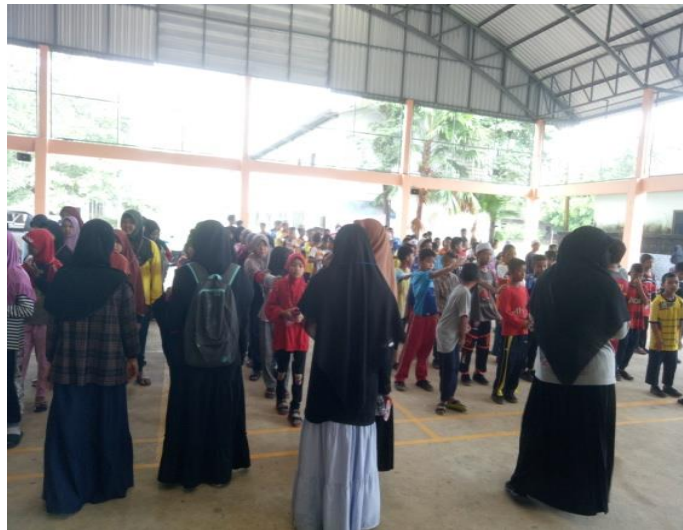
Figure 3. English Camp