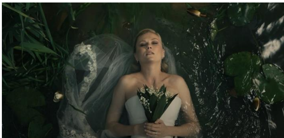
Figure 6. Justine drowning in the opening scene of the movie

The circumstances that make her unable to cope with the problems that occur within herself makes her weak mentally and physically. It is seen that Justine feels not only mentally exhausted, but also powerless to do something simple such as eating and bathing. She was drowning from depression and she is fully aware of it. Again, Trier actually spoiled everything in front about the depression that the main character had.