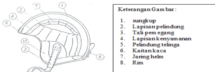
Figure 2 Open Helmet Construction (Open Face)