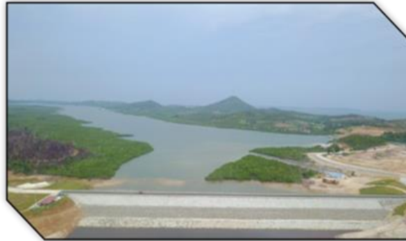
Figure 4. Sei Gong Dam

Blue economy sustainability is the concept of combining renewable energy from marine resources with a sustainable economic approach in the marine and fisheries sector. The potential for renewable energy in Sijantung sub-district is quite large, whether it is using the Sungai Gong Dam as a Floating Solar Cell area, using marine kinetic waves as an electricity generator and using sea plants as bio fuel / bio diesel and wind power plants.