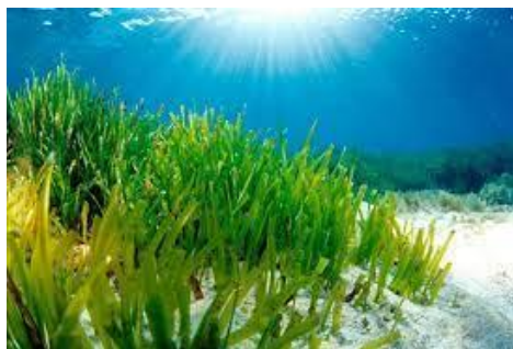
Figure 5. Seagrass (Endemic Shallow Marine Plant)

If you look at it, currently only around 7.4 percent of the ocean can be protected. The existence of a marine park will provide many benefits for marine biodiversity and will be able to help increase the population of farmed fish which in turn will also provide other additional benefits such as sustainably increasing the blue fisheries sector, as well as in Sijantung the potential for seagrass beds and wild seaweed or seaweed cultivation quite promising to be developed.