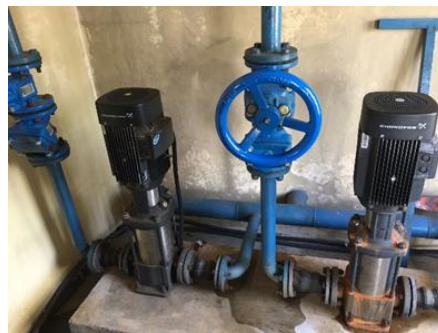
Figure 5. Centrifugal pumps in Tiangwangkang

All of these components were carefully designed and implemented with precision to ensure that this clean water distribution system operates with high efficiency and provides a reliable water supply to the community, meeting their needs with the high level of quality and sustainability desired in this project. And there are also two main pumps that supply water to Lance Island, ensuring a reliable supply for the area.