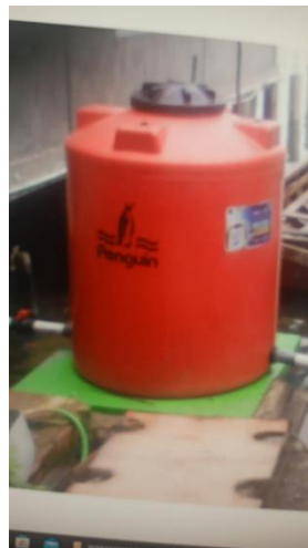
Figure 10. Flush Tank

In Tiangwangkang Village, 3 Communal IPAL Units and 2 flush tank units were built. The function of this flush tank is to clean the wastewater pipe network from the house to the Communal IPAL. This cleaning process is carried out periodically so that there are no blockages in the wastewater pipe network from the houses.