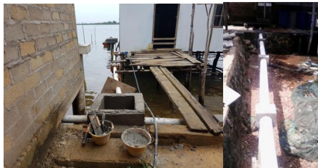
Figure 11. Pipe Installation

We use PVC as a material to channel used water and human wastewater in buildings. For waste and dirty water pipes, we chose PVC class D with a diameter that matches the plan. Connecting PVC pipes is carried out using good quality solvent cement. Before pipe connection, we clean the parts to be connected thoroughly, making sure that there is no dirt, water, or other substances present there. In addition, solvent cement must be applied evenly to the surfaces to be joined.