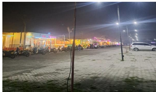
Figure 3 Parking Area

Of course, parking is one of the things that helps attract visitors to visit Sunset Land, because it is for the comfort and safety of the visitors themselves.