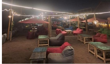
Figure 2 Stall