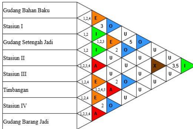
Figure 2 Activity Relationship Chart

The coordinates above are obtained from the company's initial layout by showing the respective coordinates of each workstation.