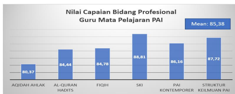
Graph 3. Descriptive Score of Profesional Field Achievement of PAI Teacher

Based on the graph above, it can be inferred that the highest achievement in mastering the professional module the SKI module, followed by the Islamic Islamic Studies and Contemporary Religious Education modules. While the lowest mastery was in the modules of aqidah ahlak, the Qur'an hadith and fiqh. The average mastery of the 6 modules is 86.81 with a very high interpretation.